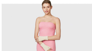
SG013 Wrist Support (1 Pair/Pk) Size : M, L (Choose 1 size) Color : Ivory