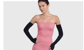
AS020 UV Protection Arm Cover Size : Free size Color : Black