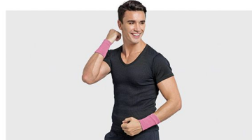
AS016 Wrist Bands Size : L Color : Pink