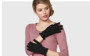
AS017 Women's Gloves Size : Free size Color : Black