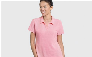
OC012 Women's Short-Sleeve Polo Shirt Size : M, L, LL (Choose 1 size) Color : Peach