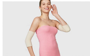
SG011 Elbow Support (1 Pair/Pk) Size : M, L (Choose 1 size) Color : Ivory only