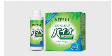
NS005 Bio Clean Travel Kit Volume : 125ml x 5 (625ml)

** Pay with UOB credit card to enjoy 12 months of 0% interest installment payment with NO processing fee.